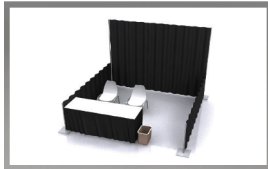
5' x 10' Turn-Key