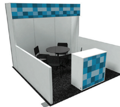
10'x10' Shell Scheme