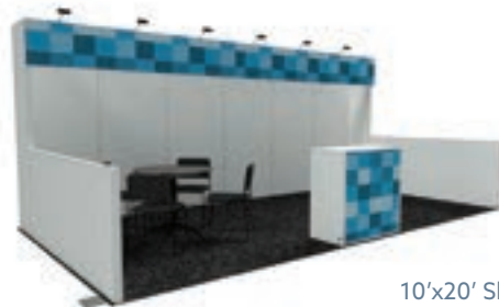
10'x20' Shell Scheme