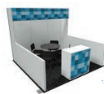
10'x10' Shell Scheme